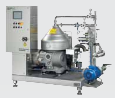
Alcoholic beverage - Juice wine and sparkling wine clarifier