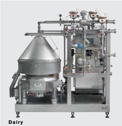
Milk Separator with automatic milk and cream standardization system

We also offer a wide range of separation process accessories enabling you to meet your separation and clarification needs from a single supplier.