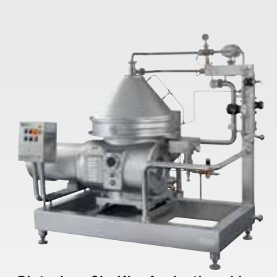
Biotech – Clarifier for lactic acid bacteria recovery