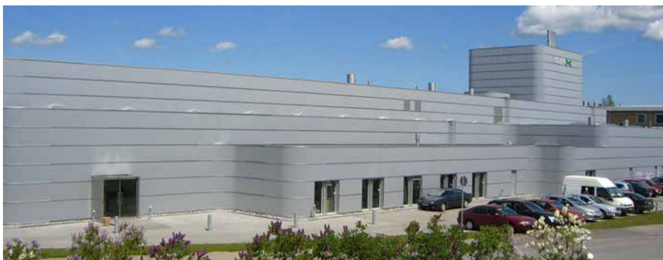
SPX FLOW innovation centre in Soeborg, Denmark

SPX FLOW offers a number of service agreement options, depending on your individual needs, and our service engineers are always available to provide applications and development support.