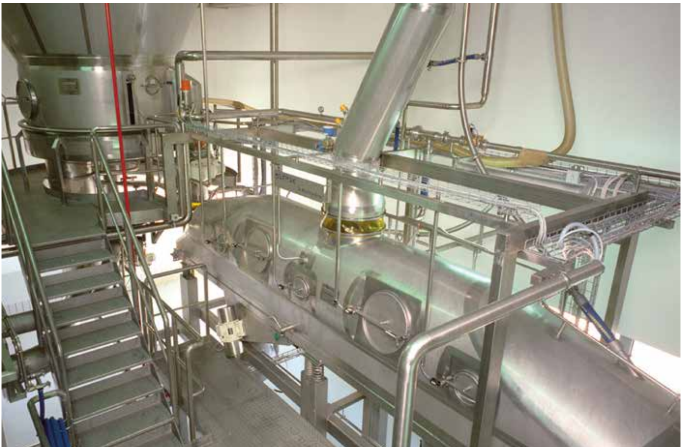
An Anhydro spray bed drying plant