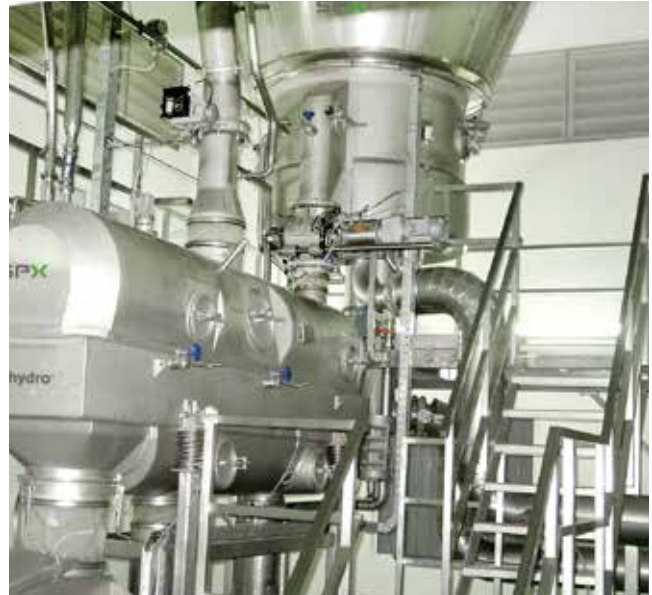
An Anhydro spray bed dryer

Furthermore, the agglomerated particles are more uniform. The plant can, however, be designed for an optional choice between the two systems, if required.