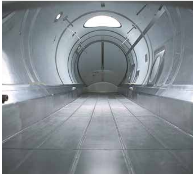
Inside view of an Anhydro external fluid bed