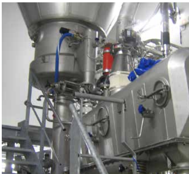
An Anhydro spray bed dryer

Separate air inlet systems to the fluid bed provide flexibility with regard to air velocity and product temperature, ensuring removal of fines and discharge at the requested product temperature.