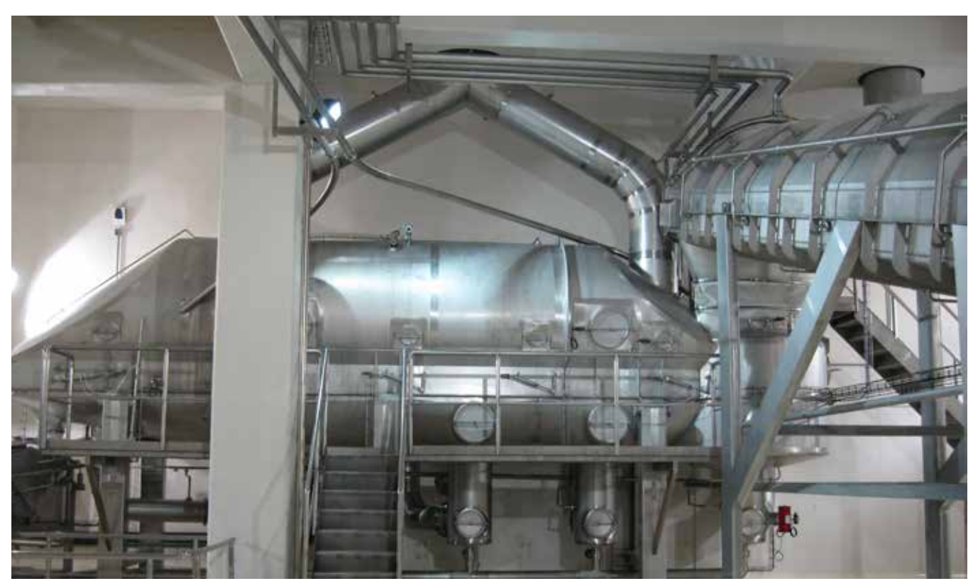
A section of a dairy drying system - a fluid bed and a crystallization conveyer

Anhydro fluid beds are also used for rewet agglomeration for the production of coarse and stable agglomerates as well as adding atomized additives. Typical examples are the production of instant skim-milk and whole milk powders. Agglomeration results in better free-flowing properties, less dust, and improved solubility and wettability.